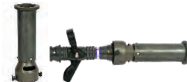
Foam Tube for Nozzle NZ-FT