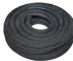
Rubber Hose HR-H-R