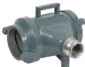
Hose Washing Machine HME-HWM