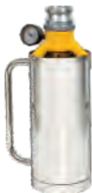
MX 5, 10 FE-FBMX (5, 10)