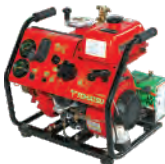
Medium Capacity Portable Pump PU-MC-THT