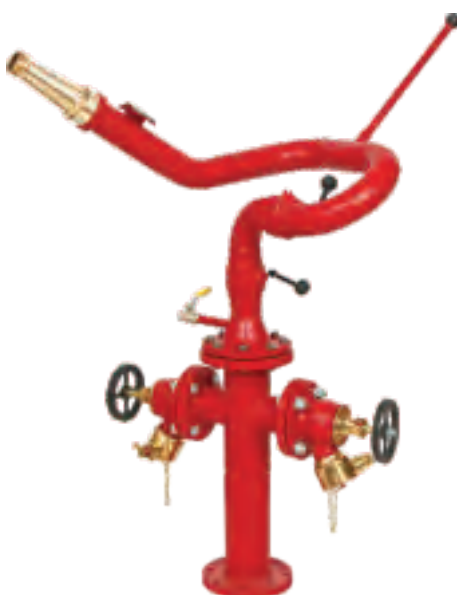
2-Way Stand Post with Monitor SPH-2WM