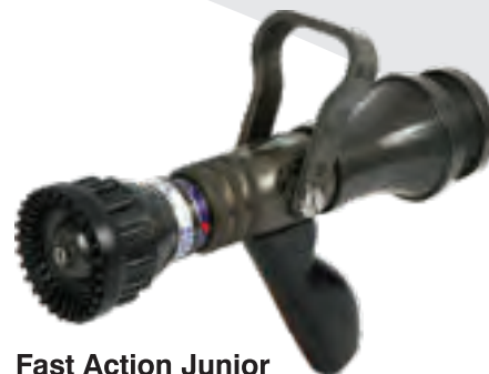
Fast Action Junior NZ-FANJ