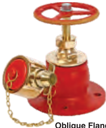
Oblique Flanged LV-OBF