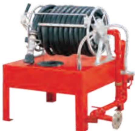
Hose Reel with Foam Tank HR-FT