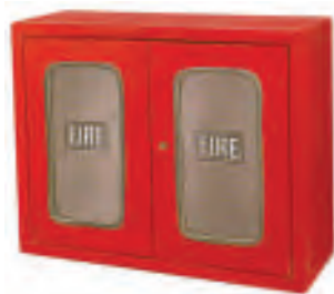
Hose Cabinet CB-HC