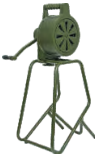
Hand Operated Siren SRN-HO