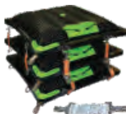
High Pressure Lifting Bags