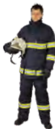
NOMEX Fire Suit