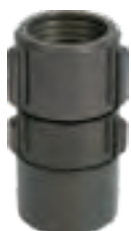
American Rocker LUG CP-AR