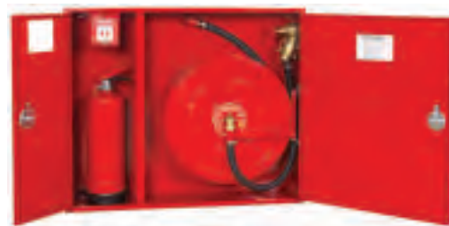
Combo Cabinet CB-CC