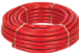
PVC Hose HR-H-PVC