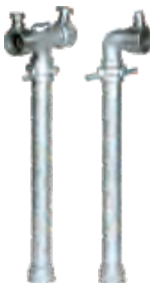
Stand Pipe SPH-SP