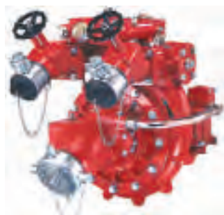
Fire Vehicle Pump PU-VP