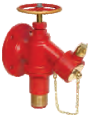
Pressure Reducing Valve LV-PRV