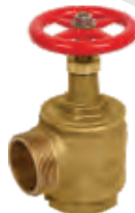
Hose Valve LV-HV