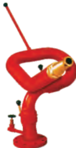
Water Jet Monitor M-WJM