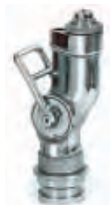
Fog Nozzle NZ-FN