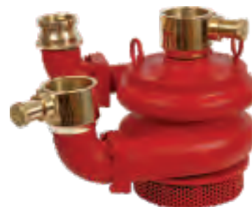
Turbo Pump PU-TP