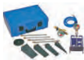
Leak Sealing Wedges & Cones