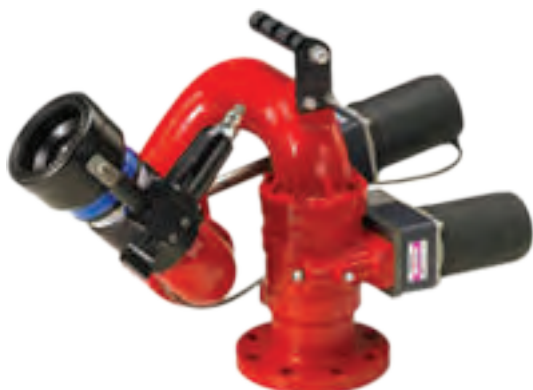
Remote Controlled Monitor M-RCM