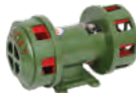
Electric Siren SRN-EO