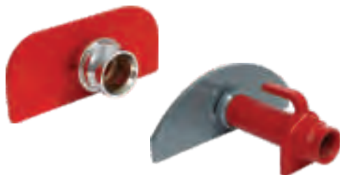
Curtain Nozzle NZ-CN