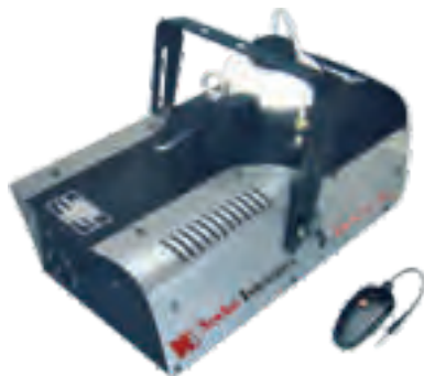
Smoke Generator SGN