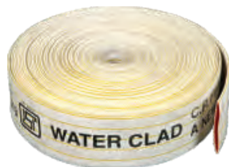
Water Clad FH-WC