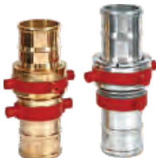
Suction Coupling CP-SC