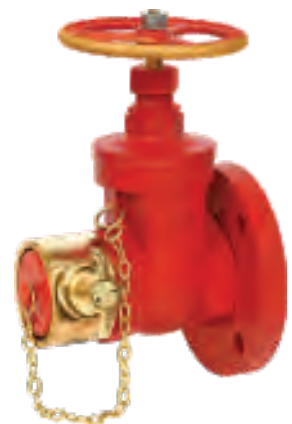
Gate Valve LV-GV