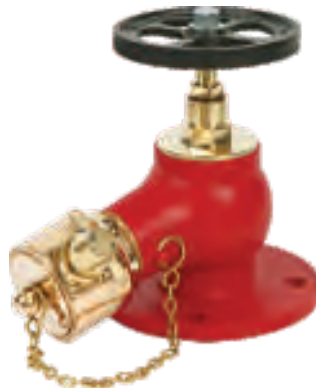
Turn Down Flanged LV-TDF