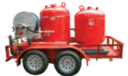
Twin Agent Skid