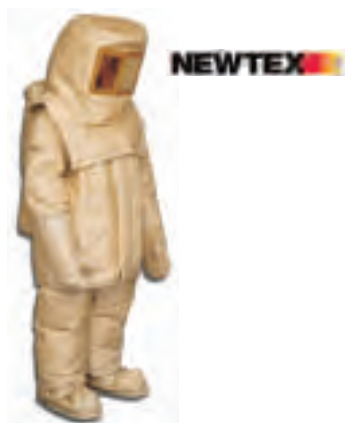
NEWTEX Fire Entry Suit