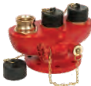
Three way Inlet Breeching DRE-3W