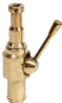
Gunmetal Nozzle HR-NZ-GM