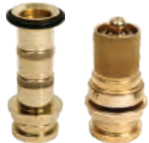
Navy Diffuser NZ-ND