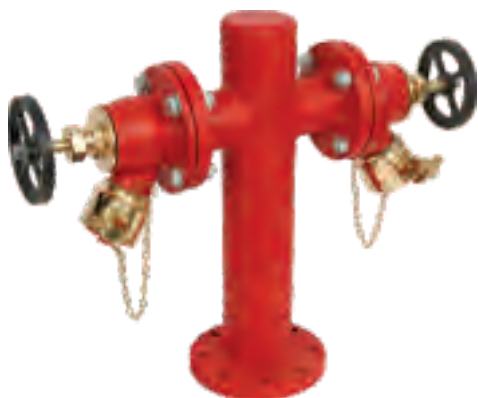
2-Way Stand Post SPH-2W