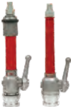
Hand Controlled Branch Pipe NZ-HCB