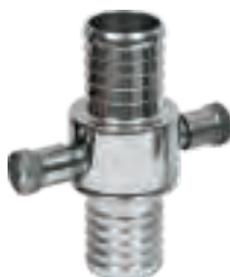
Instantaneous Type Coupling CP-IS