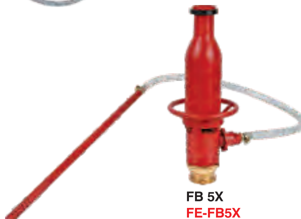
FB 5X FE-FB5X