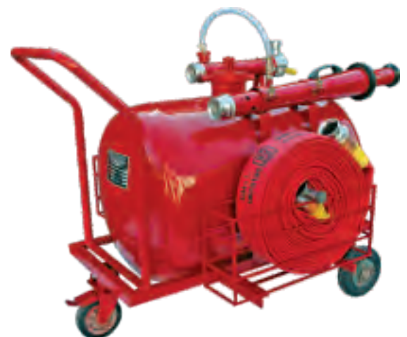
Stainless Steel Tank FE-MFU-SS