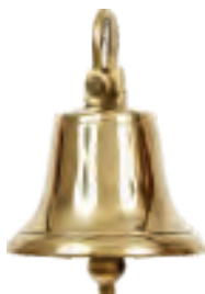
Fire Bell SRN-FB