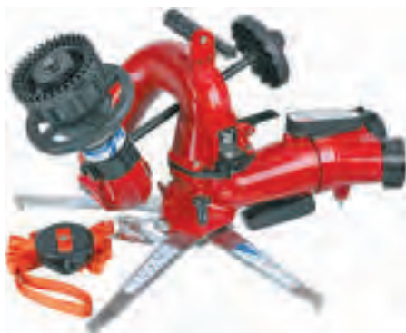
Portable Water / Foam Water-Commando M-Commando