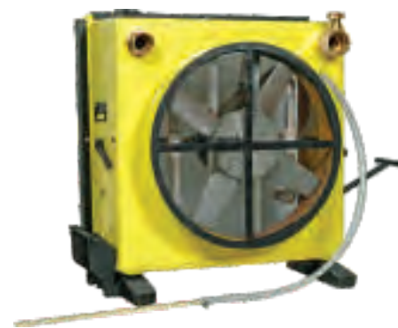
Hi-Ex Foam Generator (MK2) FE-FGMK2