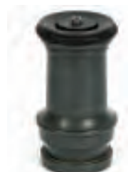
Diffuser Nozzle NZ-DN