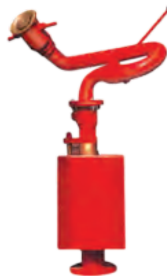
Standpost Mounted Oscillating Monitor M-OM