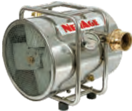
Water Driven SET-WD