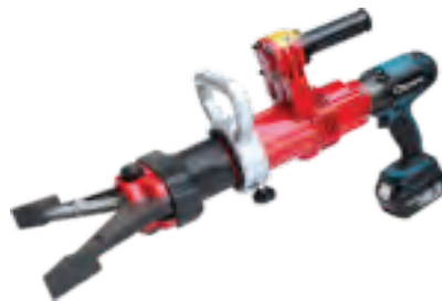
Battery Operated Tool