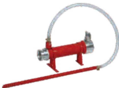
Inline Foam Generator FE-FGI