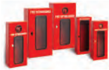
Extinguisher Cabinet CB-EC