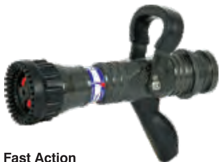
Fast Action NZ-FAN