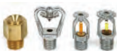
Spray Nozzles & Sprinklers