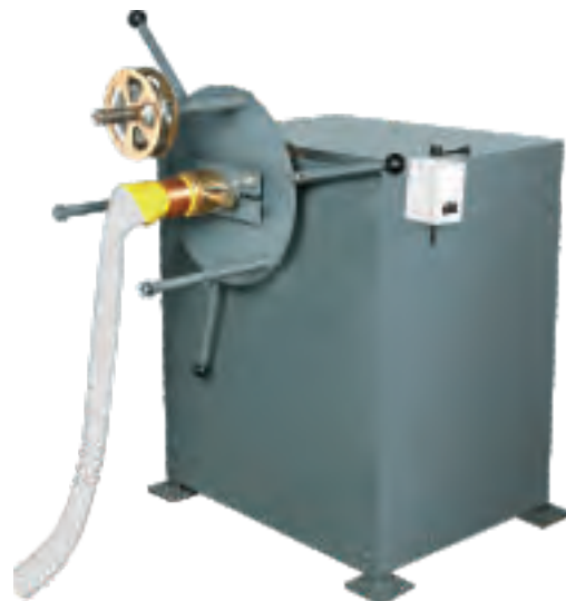
Electrical Hose Binding Machine HME-EHB