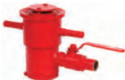
Aqua Foam M-MN-AFN