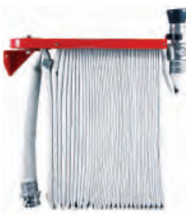
Hose Rack Assembly HR-HRA