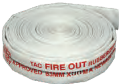
Fire Out FH-FO