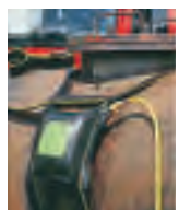
Mini Leak Sealing Kits