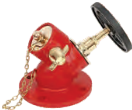
Bib Nose Flanged LV-BNF