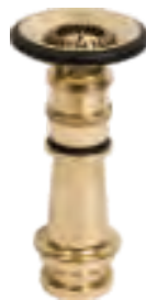
Triple Purpose NZ-TP