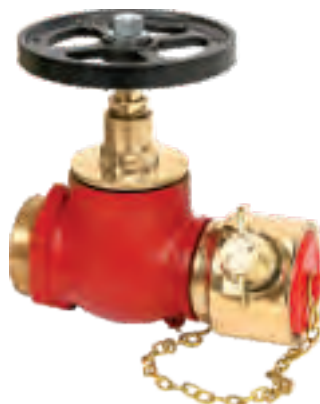
Straight Threaded LV-STT