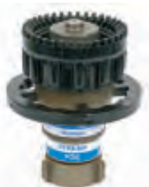
Jet and Spray Nozzle M-MN-JSN