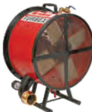
Hi-Ex Mini Turbex FE-FGMINI