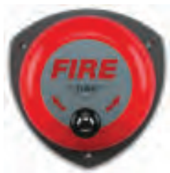
Rotary Bell SRN-RB