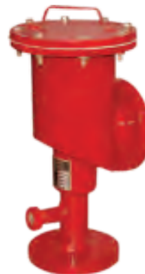
Foam Maker with Vapor Seal Chamber FE-FMWV