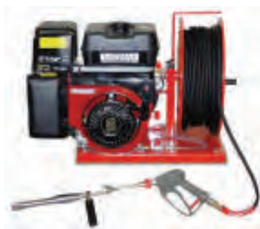
Ultra High Pressure Pump PU-UHM