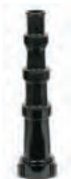
Stackable Tips Jet Nozzle M-MN-STJ