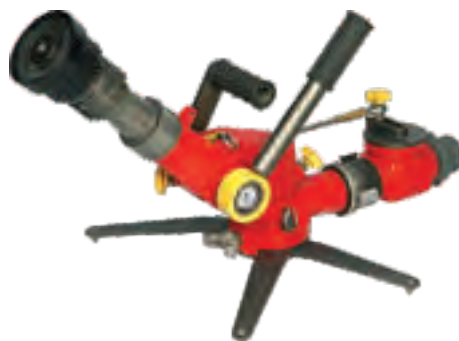
Portable Oscillating Monitor M-Ranger