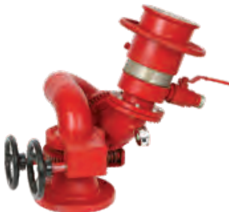
UL Listed Monitor-Tornado M-Tornado