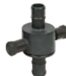
Reduced Shank CP-RIC