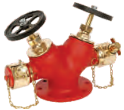
Double Headed Hydrant LV-DOT