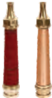
Long Branch Pipe NZ-LB