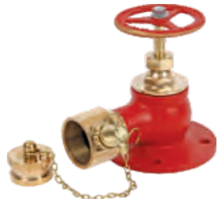
Right Angled Flanged LV-RAF