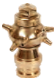
Revolving Branch NZ-RB