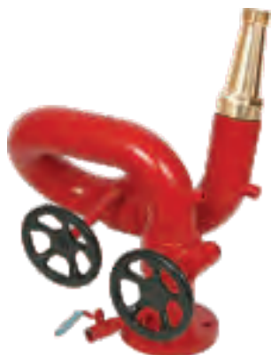
Long Range Water Monitor M-LRWM