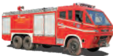
Multi Purpose Tender