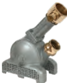
Adjustable Ejector Pump PU-AEP