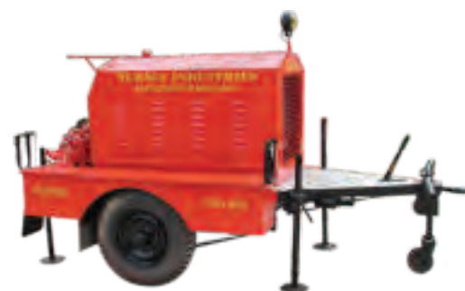
High Capacity Trailer Mounted Pump PU-TM