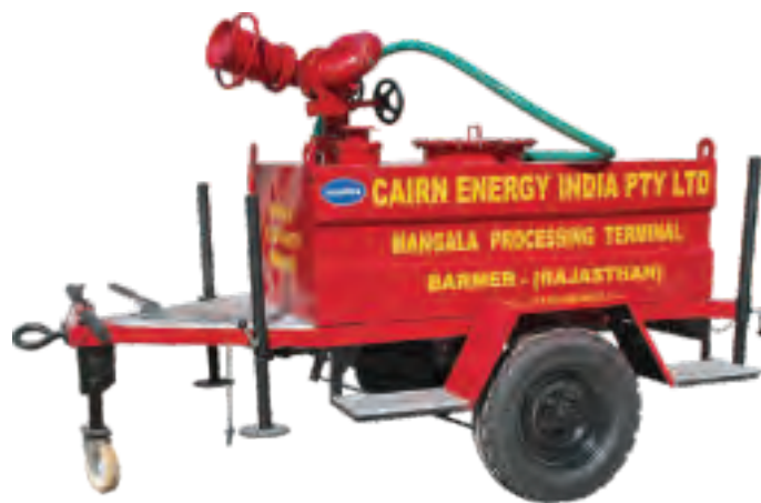
Trailer Mounted Monitor with Foam Tank M-TMFT