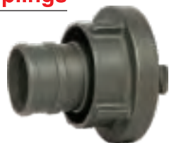
Storz Couplings CP-STR