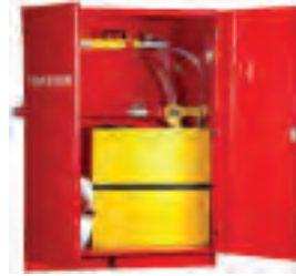
Foam Station Cabinet CB-FSC