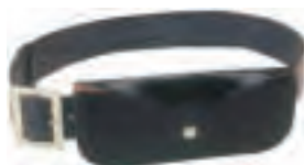
Belt & Pouch