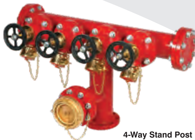
4-Way Stand Post SPH-4W