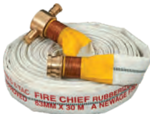
Fire Chief FH-FC