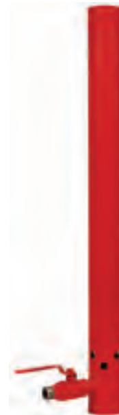
Foam Barrel M-MN-FB