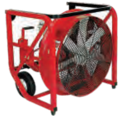
Engine Driven SET-EGD