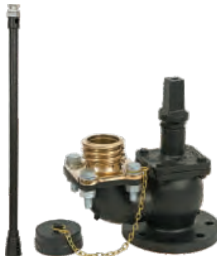
Underground Fire Hydrant & Key SPH-UG / SPH-UGK