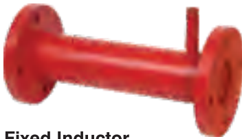
Fixed Inductor FE-FID