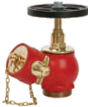
Oblique Threaded LV-OBT