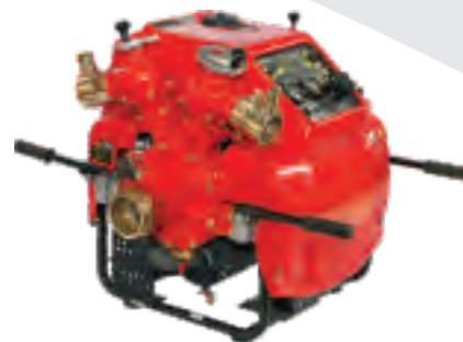
High Capacity Portable Pump PU-HC-THT