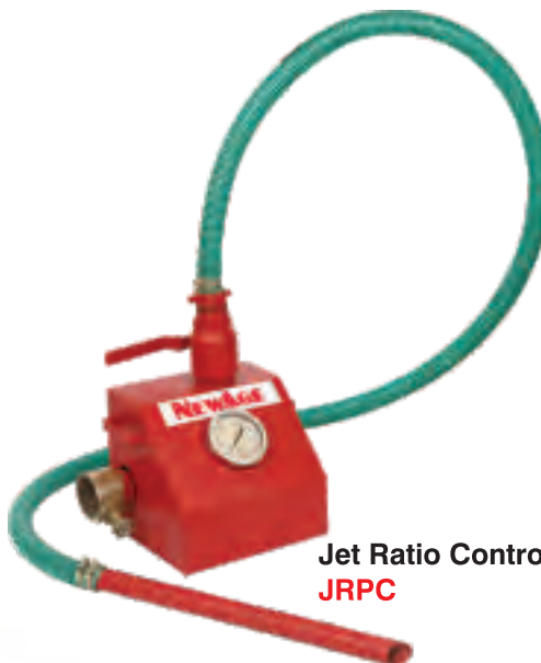
Jet Ratio Controller JRPC