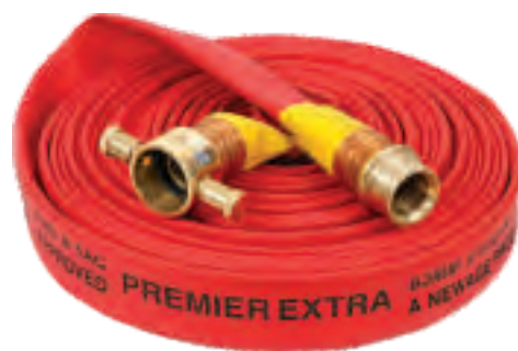
Premier Extra FH-PE