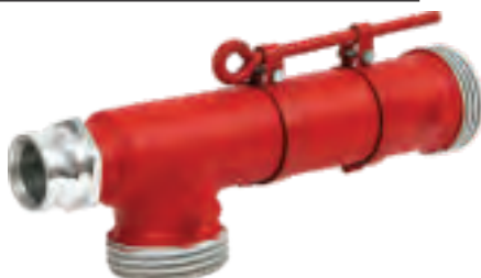
Ejector Pump PU-EP