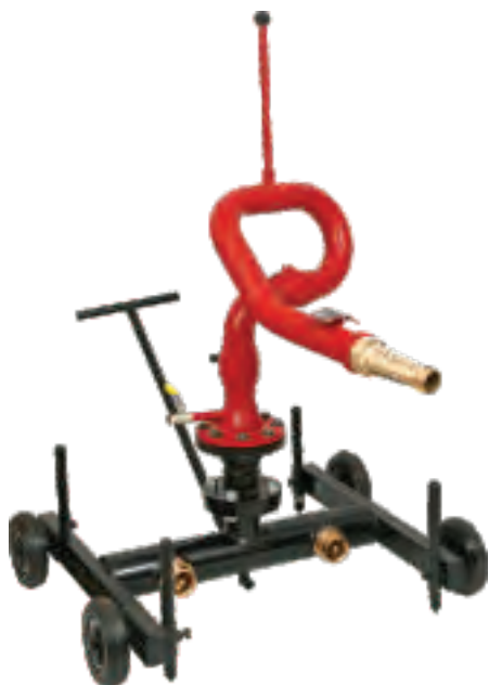
Trolley Mounted Water / Foam Monitor M-TMM