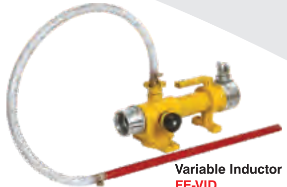
Variable Inductor FE-VID