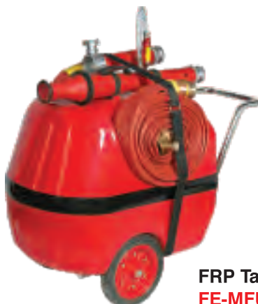
FRP Tank FE-MFU-FRP