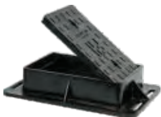
Surface Box SPH-SB