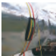
Leak Sealing Kits