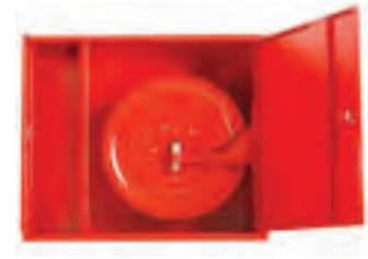
Hose Reel Cabinet CB-HRC