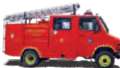
Mini High Pressure Tender