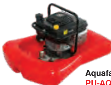
Aquafast Floating Water Pump PU-AQF