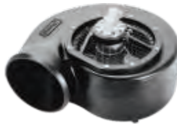
Hydraulic Operated SET-HO