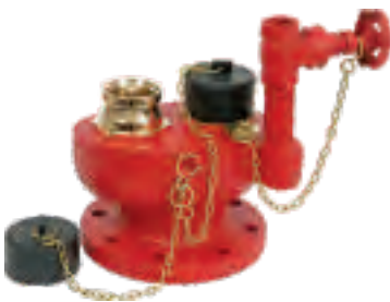
Two way Inlet Breeching DRE-2W