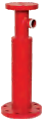
Foam Maker without Vapor Seal Chamber FE-FMWOV