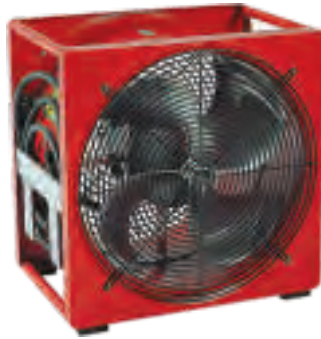
Electric Driven SET-ED