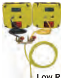
Low Pressure Lifting Bags