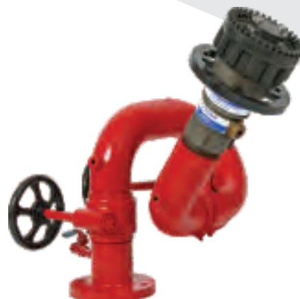
Long Range High Volume Water/ Foam Monitor M-LRHV