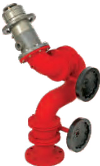
Vehicle Deck Monitor M-VDM