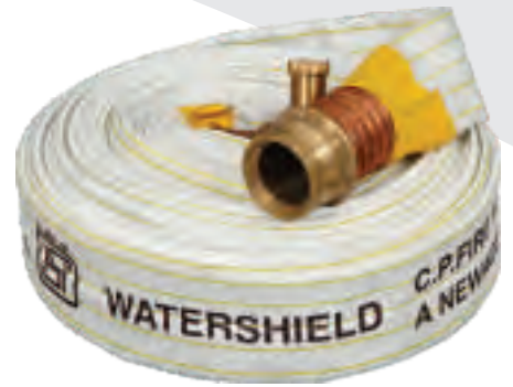
Water Shield FH-WS