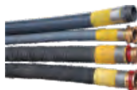
PVC and Rubber Suction Hose PSC & RSC