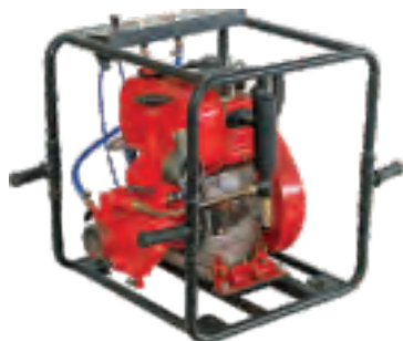
Low Capacity Fire Fighting Pump PU-275