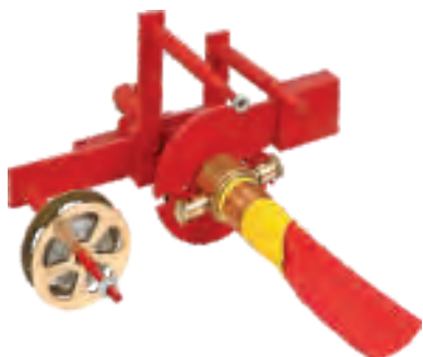
Manual Hose Binding Machine HME-MHB