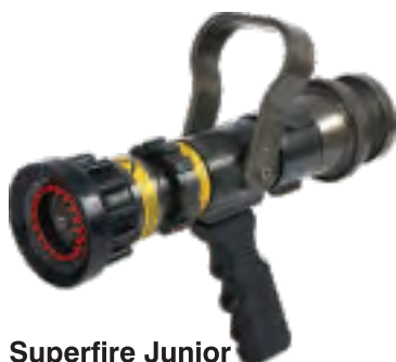
Superfire Junior NZ-SPFJ