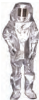
Aluminized Fire Entry Suit