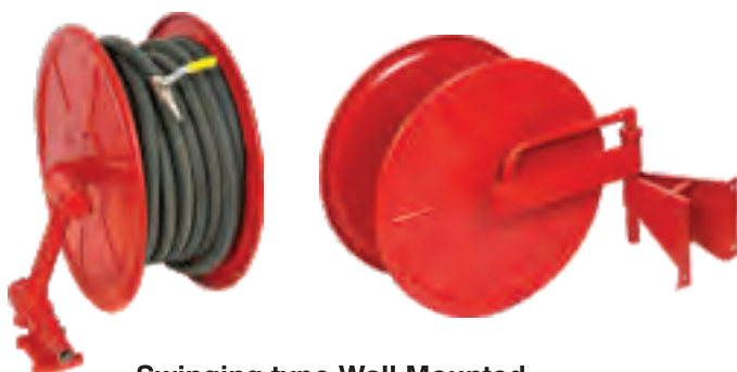
Swinging type Wall Mounted HR-WM