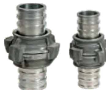
Russian Standard Gost Coupling CP-RSG