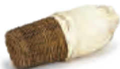
Basket Strainer BKS