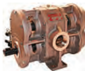
Foam Pump PU-FP