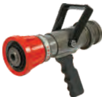
Aquajet Multipurpose NZ-AQ