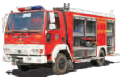
Rescue and Hazmat Tender