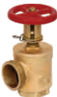
Pressure Restricting Valve LV-PRT