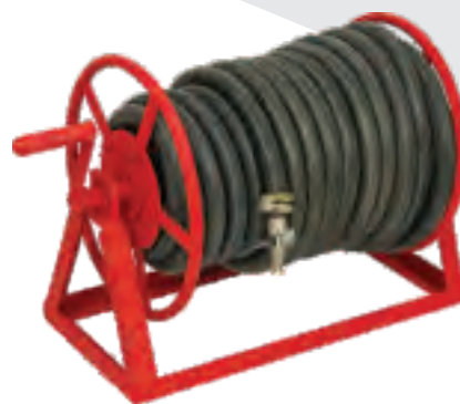
Stand Mounted HR-SM