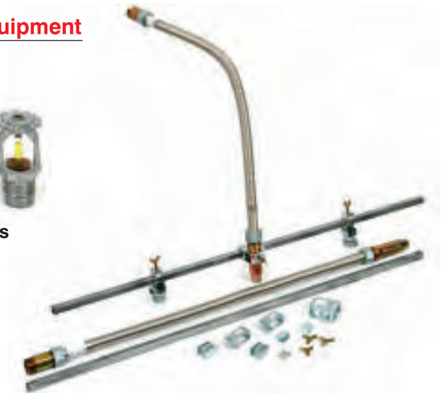
Flexible Sprinkler Hose