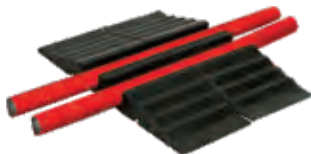
Hose Ramp HME-HRP