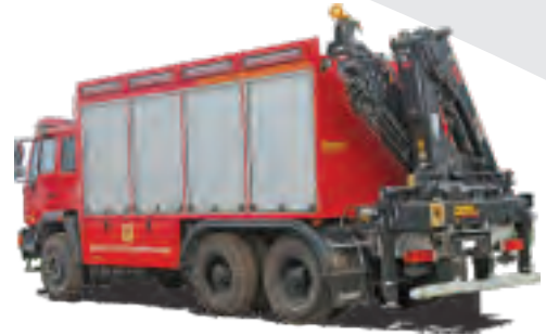
Rescue Vehicle with Crane