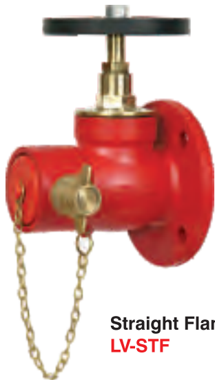
Straight Flanged LV-STF