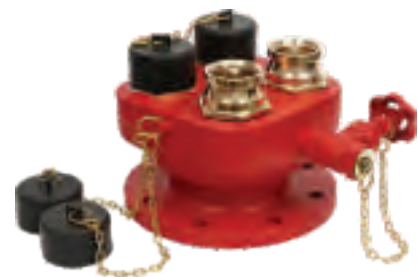
Four way Inlet Breeching DRE-4W